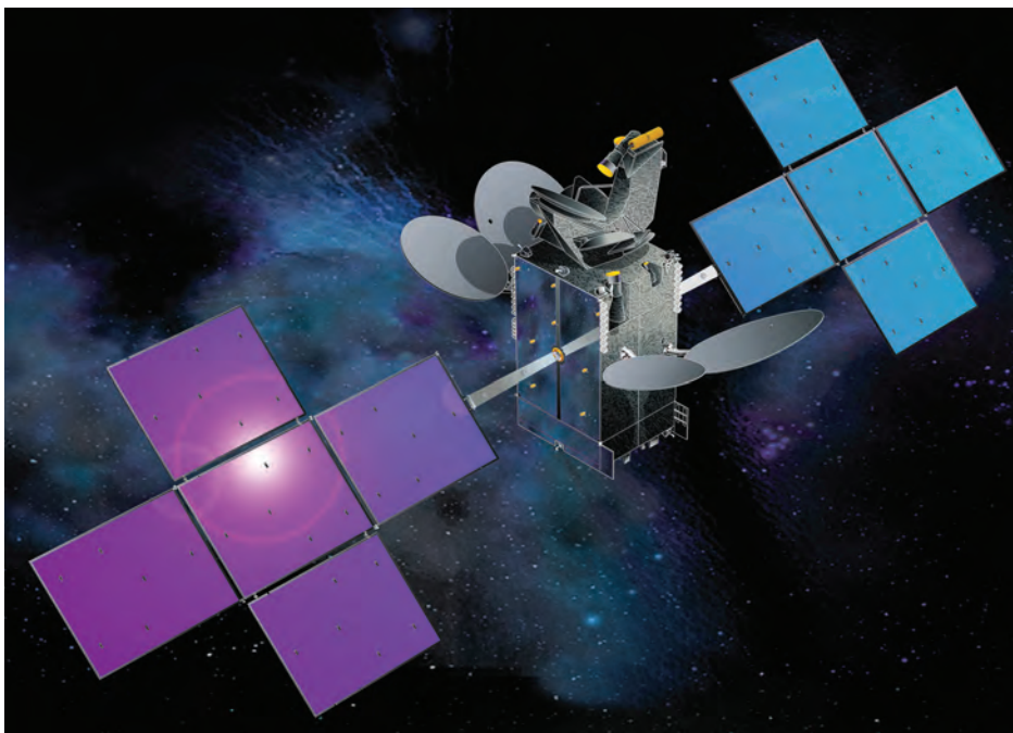
Figure 3. Intelsat 14 is a communications satellite owned by Intelsat located at 45° West longitude, serving the Americas, Europe, and African markets.

Nowhere is this truer than in the role that the commercial satellite industry has played in supporting the dramatic increase in use of unmanned aerial vehicles (UAV). The success of early UAVs drove the demand for more UAV flights and more and better onboard sensors suites, which, in turn, drove the need for more satellite capacity. Once the data is collected, it must be dispersed for action. The quickest way to do this in theater is via satellite. This raises a fundamental question for the future: should the DoD create an enduring